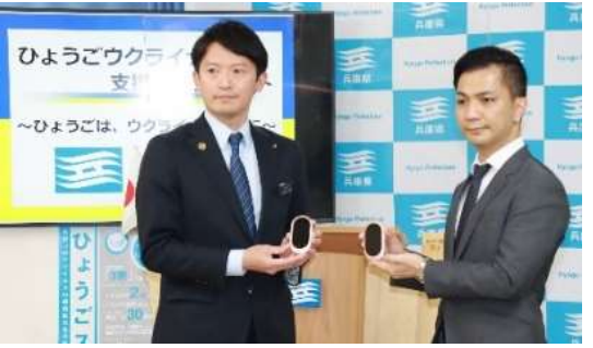
Offering of AI translation devices

Al translation devices, daily necessities, food & beverages, household electronic appliances, housing, e-cash cards (¥100,000 pre-charged/household), e-gift cards (¥5,000/person), job opportunities, invitation to events (e.g., concerts), etc.