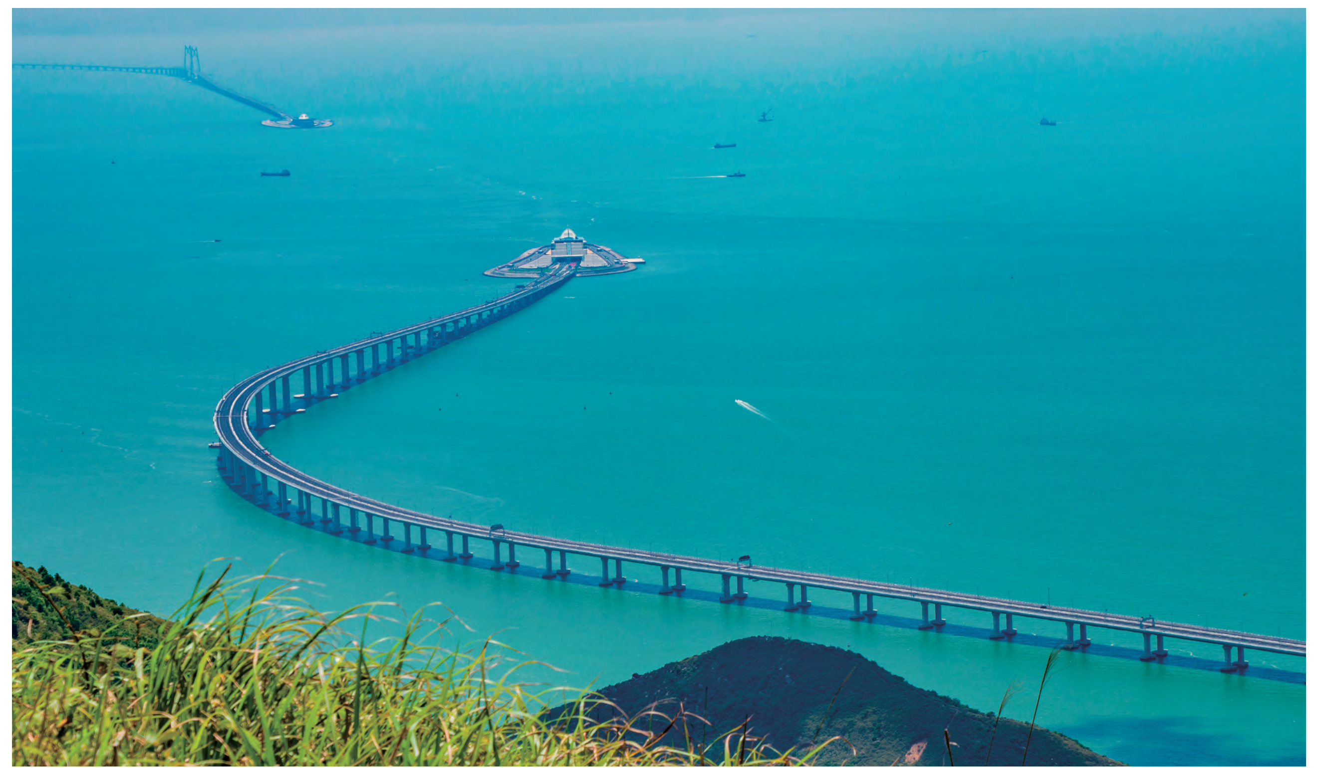
広東省と香港、マカオを結ぶ港珠澳大橋 The Hong Kong-Zhuhai-Macao connecting Guangdong, Hong Kong and Macao