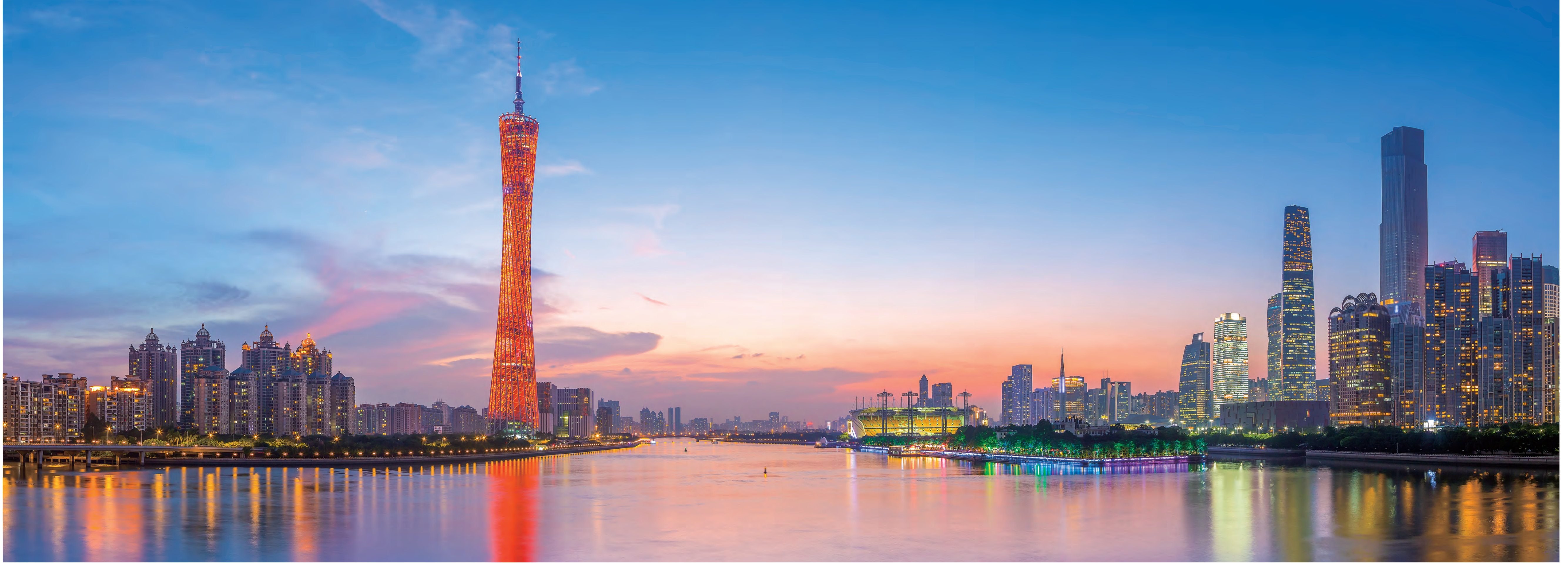
広州市のランドマーク廣州タワー The Canton Tower, the landmark of Guangzhou