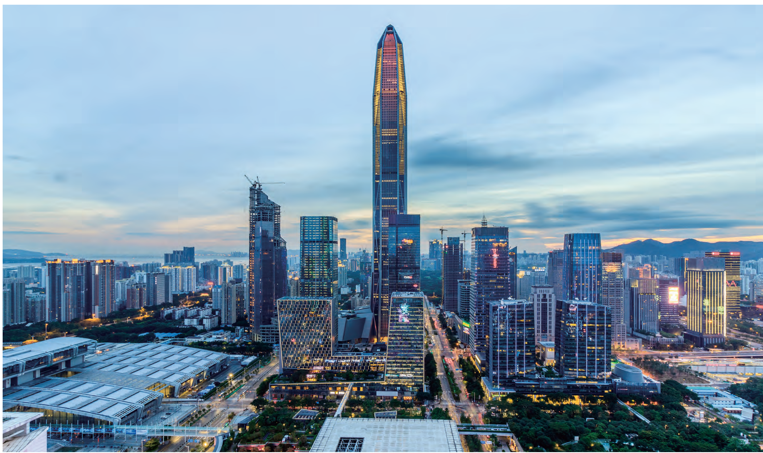
深セン市の高層ビル群 Skyscrapers in Shenzhen City